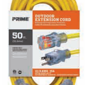
Available in U-Ground 14/3 high-visibility yellow and 12/3 blue with red stripe, and 12/3 SJTW

Available in 14/3 and 12/3 SJTW in dynamic color combinations including red/white, green/red and blue/yellow